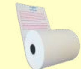
Custom Printed Thermal Paper