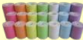
Color Thermal Paper