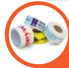
Printed Self Adhesive Tape