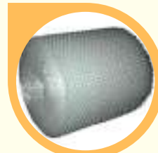
Air Bubble Roll