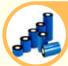
Barcode Wax Ribbon

SWISS BRAND Custom Printed Tape eradicates pilfering and tampering. Using packaging tape printed with your business logo and information is the perfect method of advertising while packaging boxes which are to shipped to customers or clients.